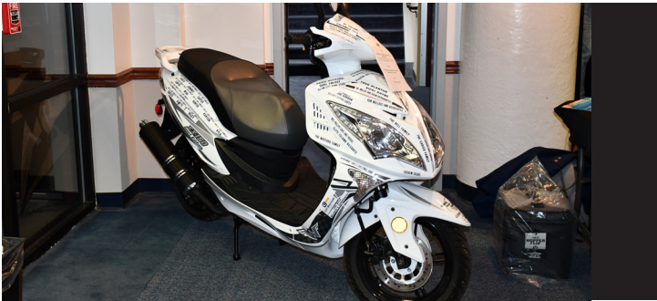
The moped will leave during the summer to travel to Memphis.