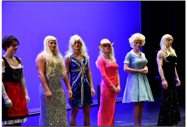
The participants dress in their evening gowns as the winner gets announced for the game.