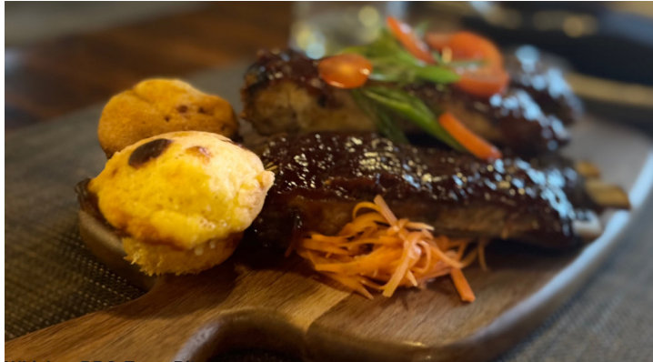
Whiskey BBQ Zo.ra Ribs