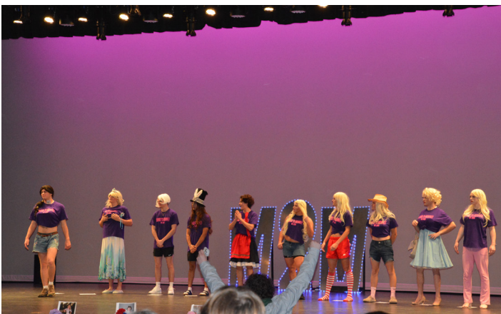
The participants are introduced to the audience.