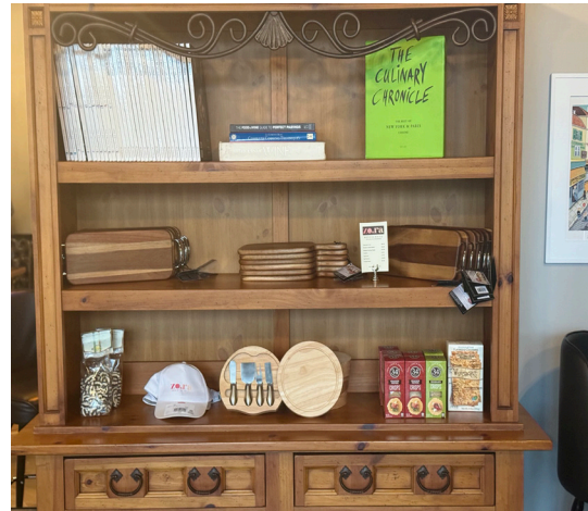
Items for sale

delicate and put-together flavor the soup itself had. With pungent notes of crab and its creamy bisque blended together, the soup was yet another luscious meal to indulge