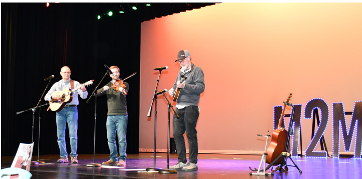
Everyone enjoyed the live entertainment.