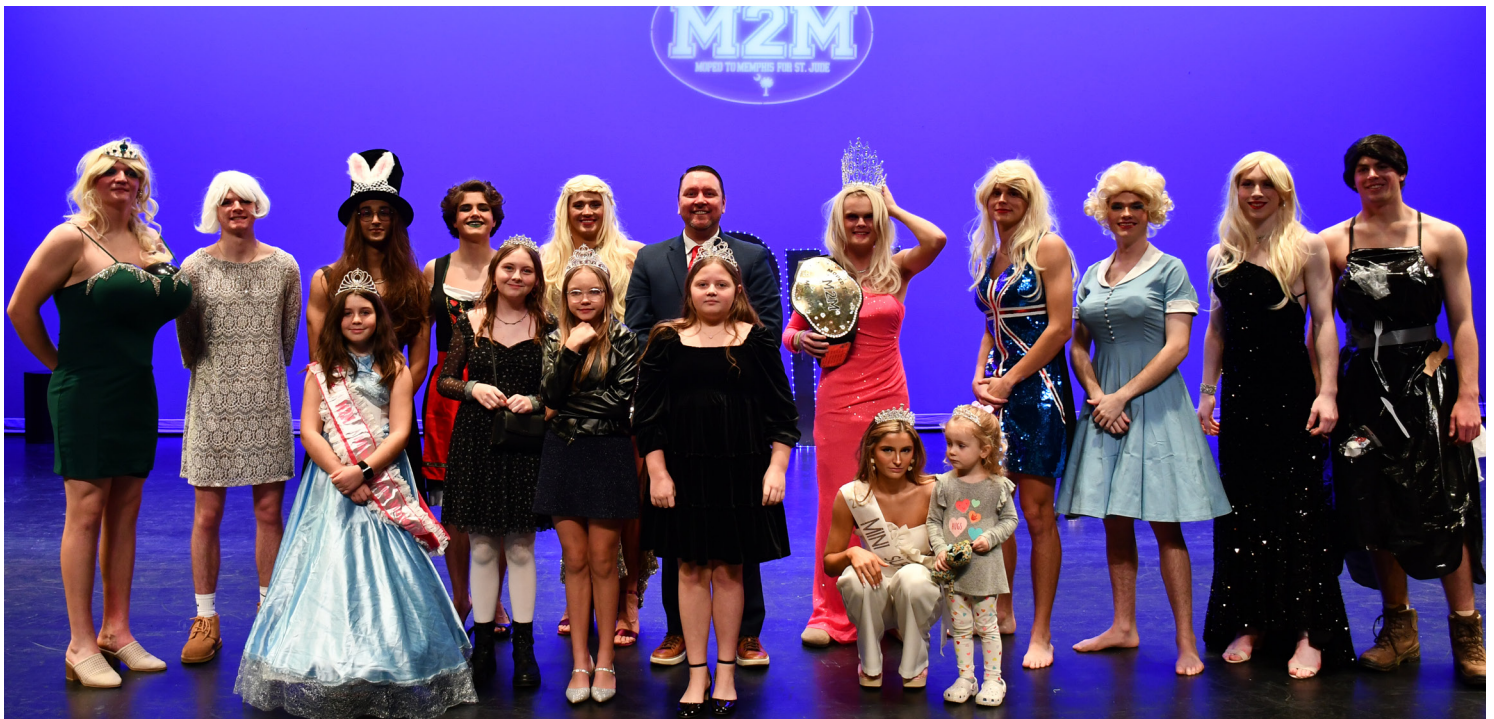
Participants line up for the final photo of the night.