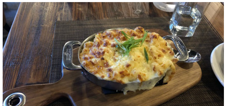
Truffle Mac & Cheese

moved to Lake Wylie, and both shared the enjoyment of dining in upscale restaurants around and in the Charlotte area. They soon noticed that there was not enough upscale dining in the Lake Wylie area. Since both shared a dream of